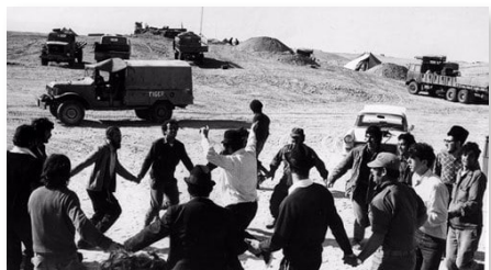
IDF soldiers dancing in the desert with Chabadniks

It was Purim, 1985. The surroundings seemed so strange to me. From childhood, Purim always meant Megillah reading, noise from noisemakers, loud music, lively dancing, people dressed up in different costumes, lots of good food, exchange of Mishloach Manot gift baskets, and a little “I’chaim” to top things off.