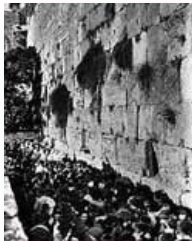
The narrow alley in front of the Western Wall

Editor's note: The Holy Temple in Jerusalem was twice destroyed — by the Romans in the year 69 CE, and by the Babylonians on the same date in 423 BCE. One wall remains standing as a living symbol of the Jewish people's ownership over the land of Israel and the city of Jerusalem — the Kotel HaMaaravi or "Western Wall."